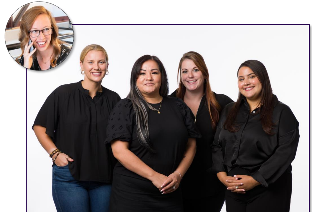
Members of our Care Concierge Team