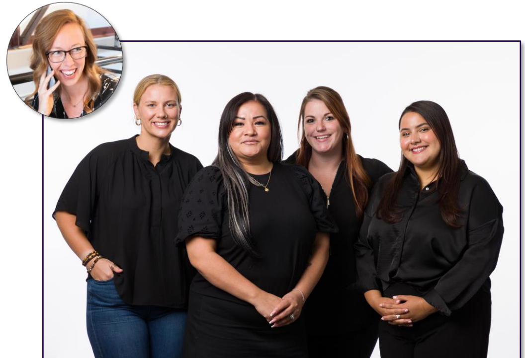
Members of our Care Concierge Team