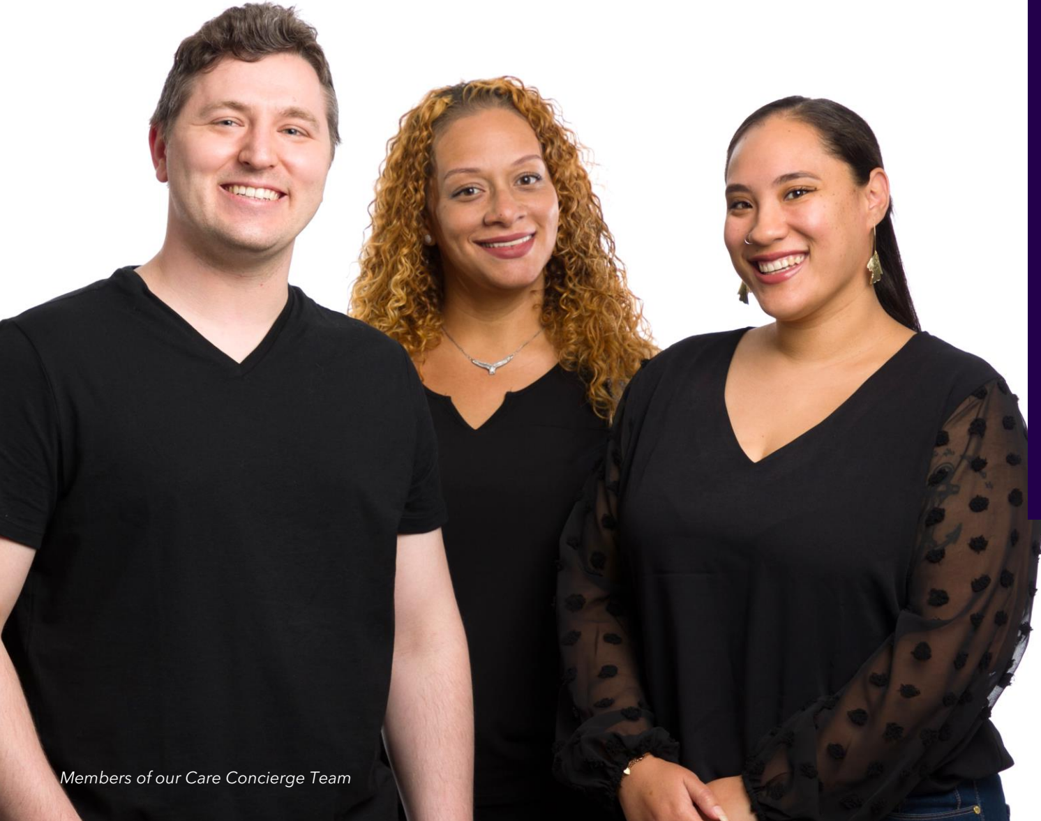
Members of our Care Concierge Team

Provides personalized “white glove” support