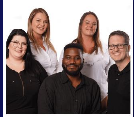
Members of the SmartShopper Personal Assistant Team

M-Th 8:00am – 8:00pm | Fri 8:00am – 6:00pm (EST)